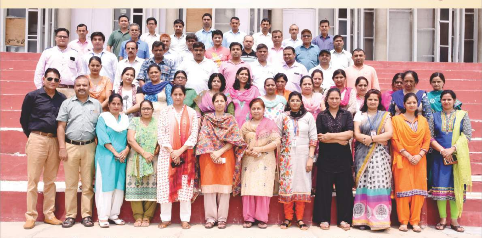
Team of Directorate of Distance Education, Kurukshetra University, Kurukshetra

To evolve a seamless system of higher distance education for sustainable life-long learning and up gradation of knowledge and skills by use of innovative approaches.